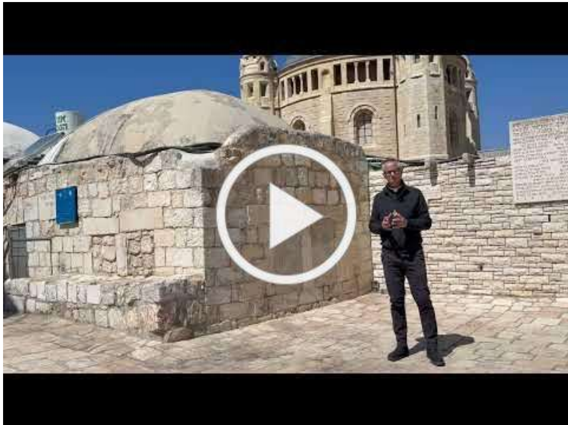
Lent/Easter 1: The Upper Room