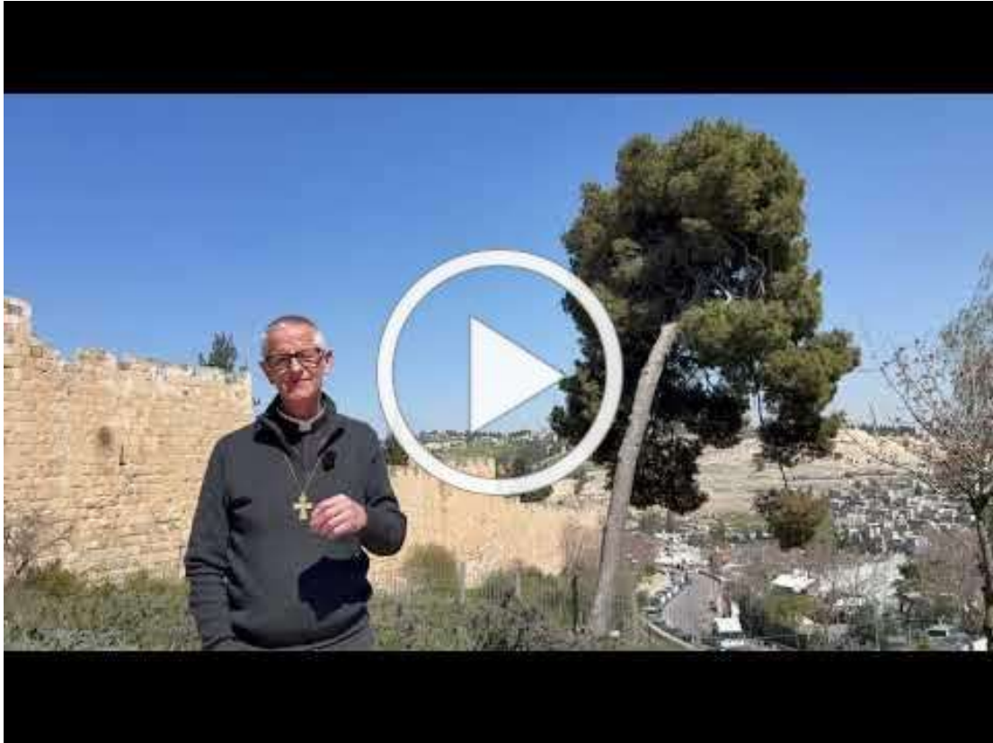
Introduction to Songs of Suffering & Hope series

Wishing a simple 'Happy Easter' doesn't feel quite appropriate to the times we are suffering. Instead, we proclaim with confidence, Christ is risen! He is risen indeed, hallelujah!