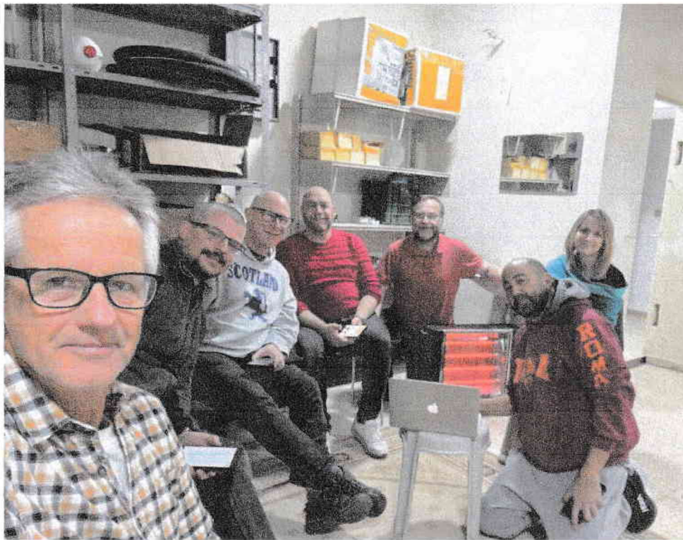
Members of St. George's College community in the bomb shelter